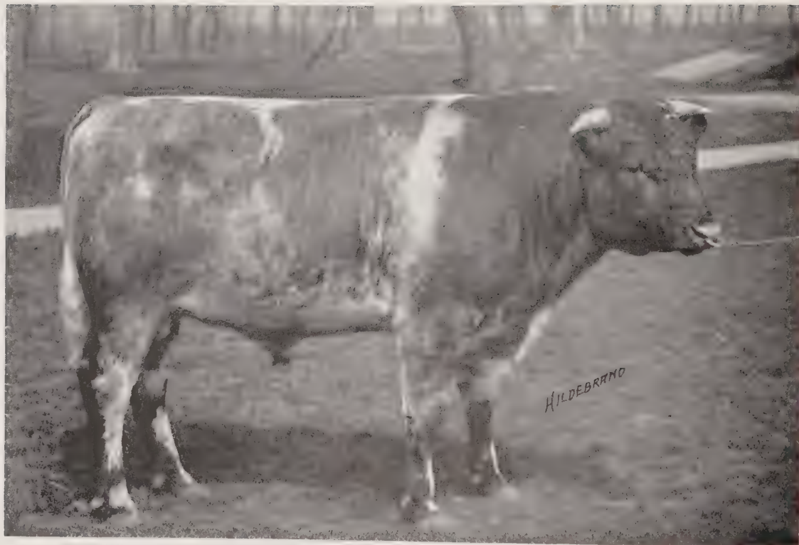
DIAMOND KNIGHT 379690.